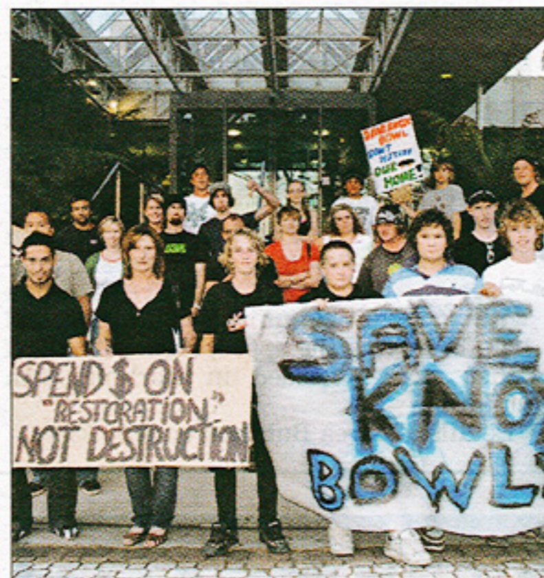
Youths protesting outside Knox Council demanding the skate park stay.

I am in my mid-40s and remember fondly all the riding around, outside activities that I was